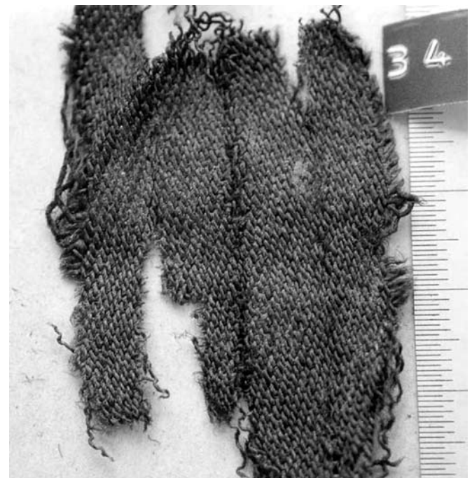
Fig. 4. Pleated textile with «indistinct weave». Lödöse DC 3417A.

For the twill textiles with «Visible weave» the prominence of the diagonal lines has proved to be one factor. Twist direction in the