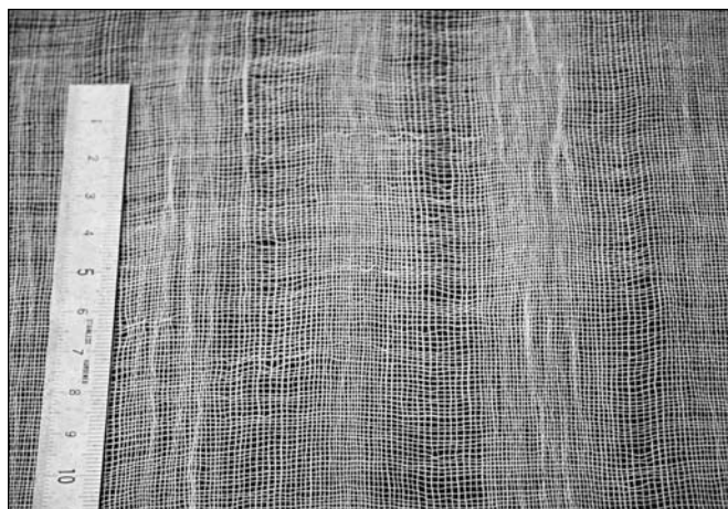
Fig. 5. Test weave made by Lena Hammerlund.

Factors that indicate whether a textile fits into «Invisible weave» are the fibre quantity and its form on the surface. The surface can be either entirely covered with an entangled web of fibres (felted) or covered with detached fibres (with a nap).