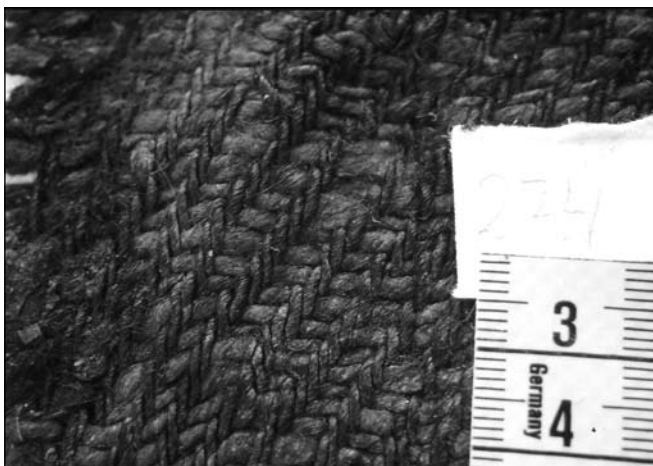
Fig. 3. Example of prominent, curving diagonal lines. Lödöse C 274.

Although several groups can be observed visually, neither these groups nor the differences between them can be described by the standard methodology of the textile archaeologist. To do this, the Pentagon model and the concepts of appearance and visual impression have been employed.