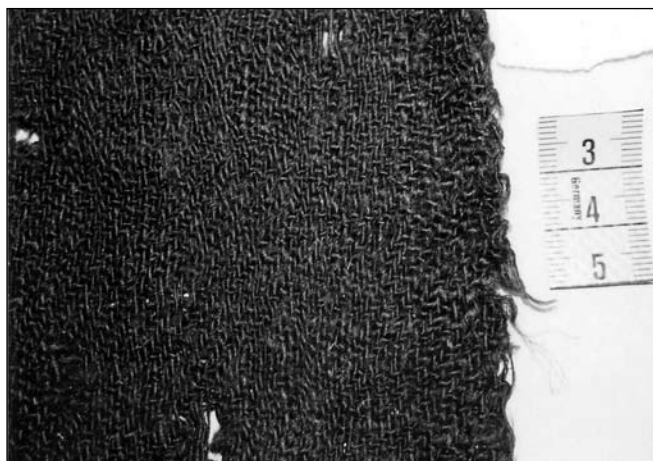
Fig. 6. Example of yarn movement. Lödöse C254.

Yarn movement in a textile can also create a disturbed weave structure. It affects the surface texture in different ways, and can be seen as either a two-dimensional or a three-dimensional movement. A well-known example is crepe fabric. Yarn movement can be described as an undulating movement in the yarn, primarily caused by yarn torsion, but friction and thread density also contribute. The fibres' resistance to being twisted causes torsion, which works counter to the spin direction. The yarn will rise where it floats, making bubbles or humps. In a more open spaced textile, the bubbles may fall sideways, and this movement